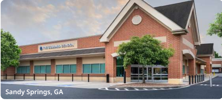
Sandy Springs, GA