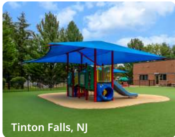
Tinton Falls, NJ